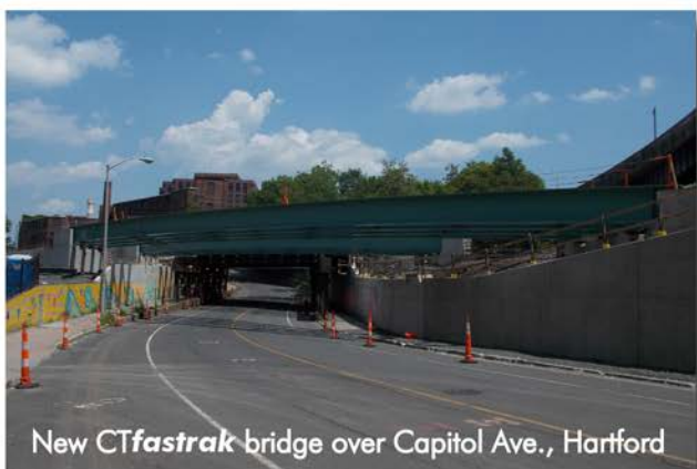
New CTfastrak bridge over Capitol Ave., Hartford