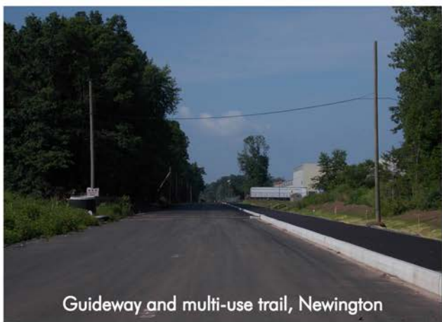
Guideway and multi-use trail, Newington