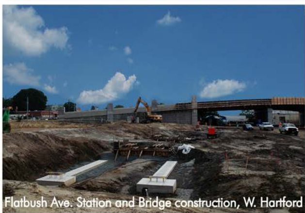
Flatbush Ave. Station and Bridge construction, W. Hartford