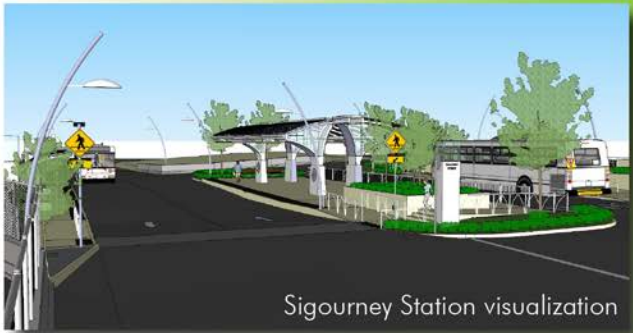
Sigourney Station visualization